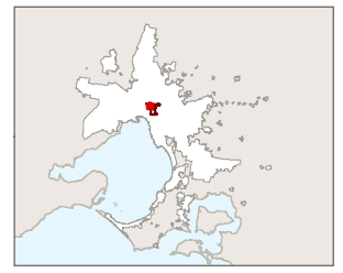
Part of Planning Scheme Map 2EAO

Disclaimer This publication may be of assistance to you but the State of Victoria and its employees do not guarantee that the publication is without flaw of any kind or is wholly appropriate for your particular purposes and therefore disclaims all liability for any error, loss or other consequence which may arise from you relying on any information in this publication.