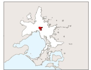
Part of Planning Scheme Map 2